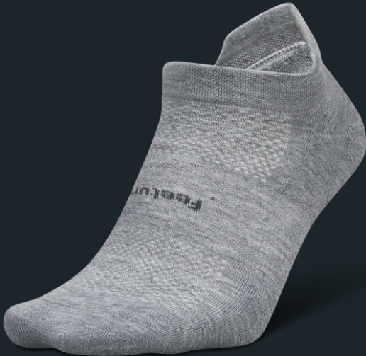
Main Shot *Required