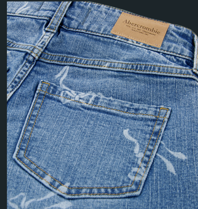
Also Acceptable 2-shot