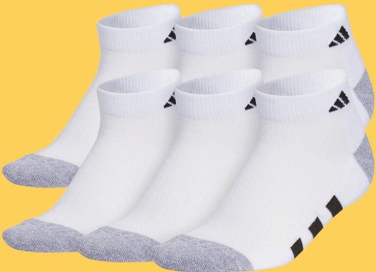
Multipack Main Shot