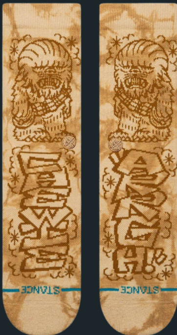
Alternative Main Shot