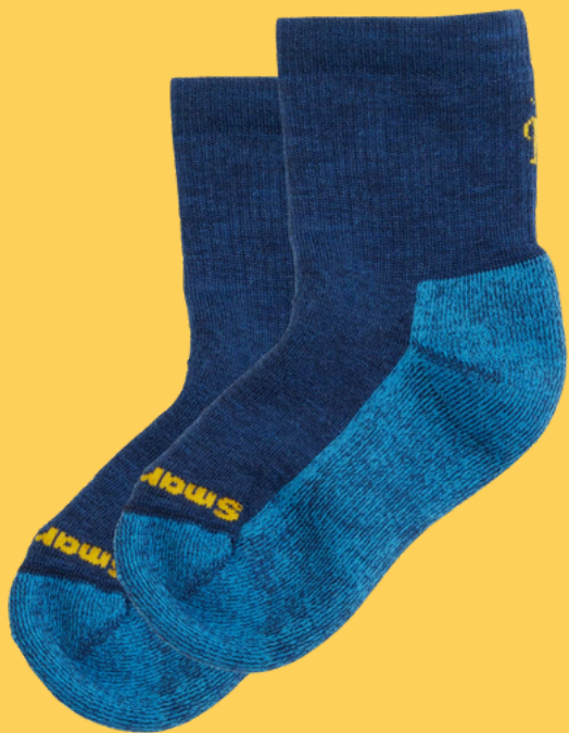
Main Shot *Required