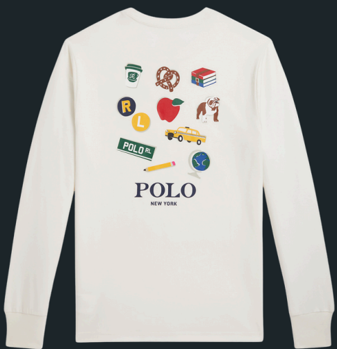
Main Shot *Required Front