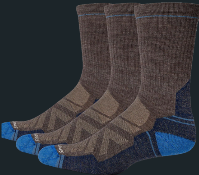
Multipack Main Shot