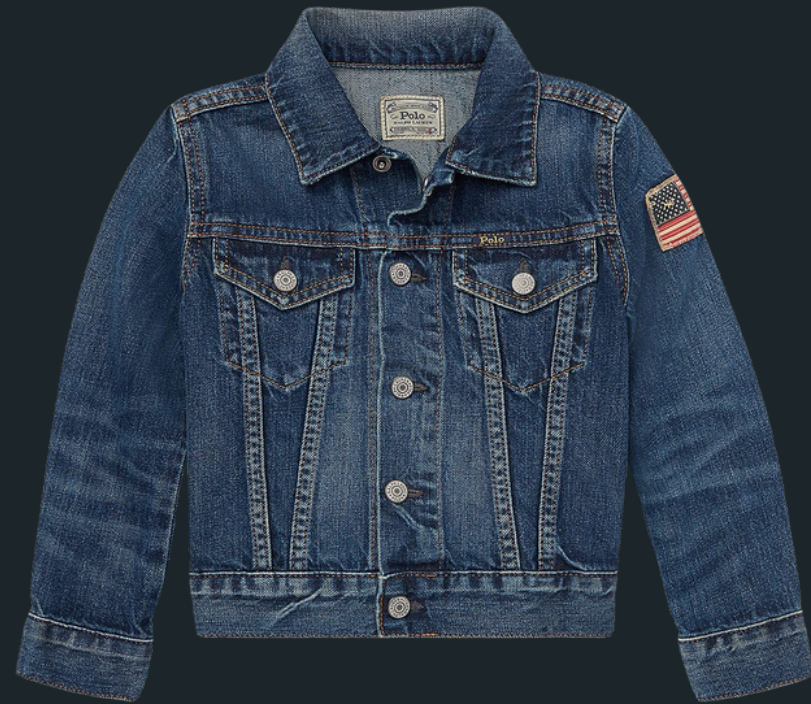
Main Shot *Required