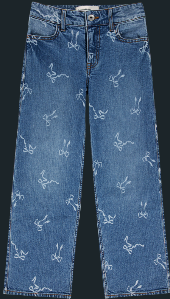
Main Shot *Required